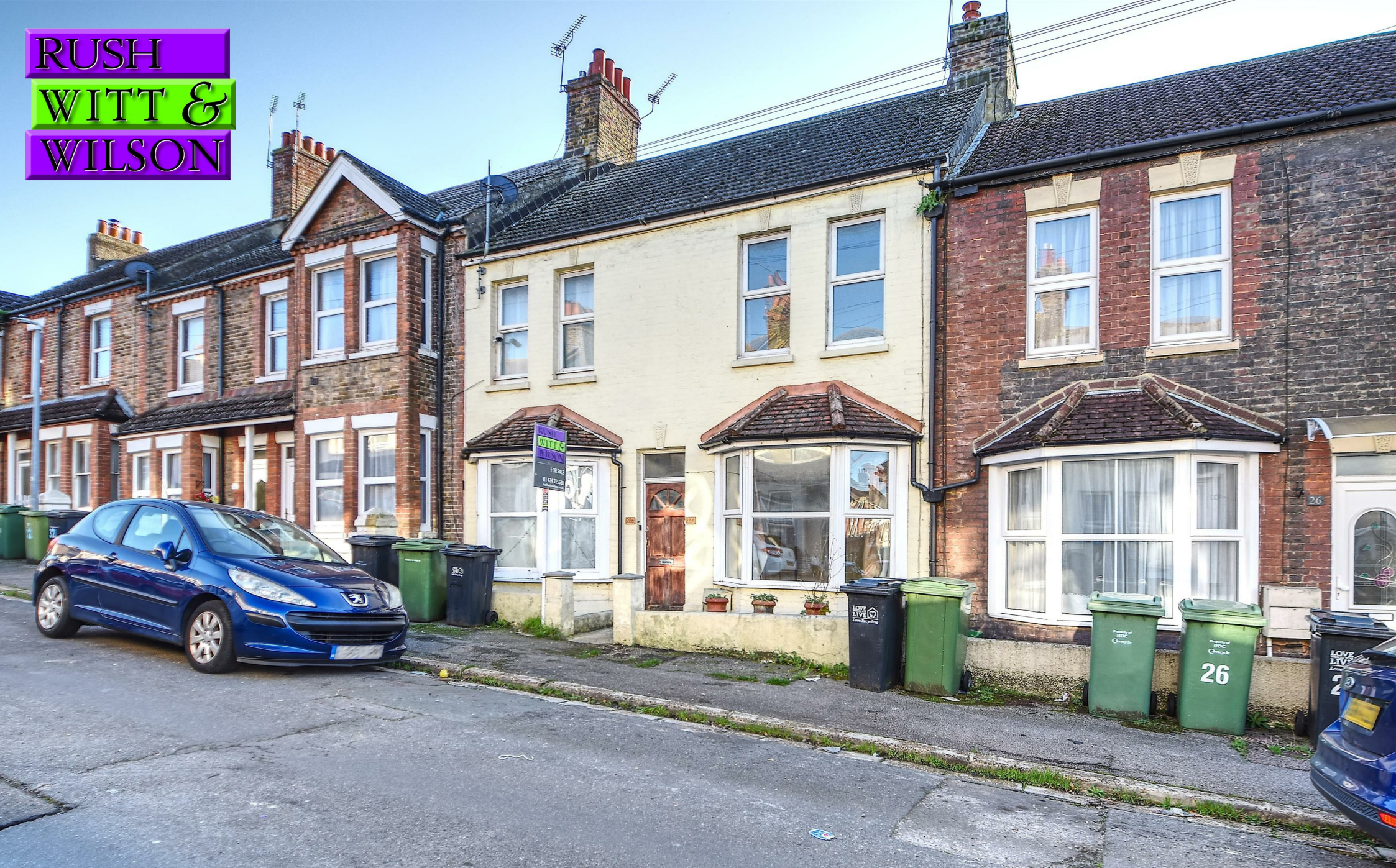
28a Salisbury Road, Bexhill-On-Sea, East Sussex TN40 2AD £195,000